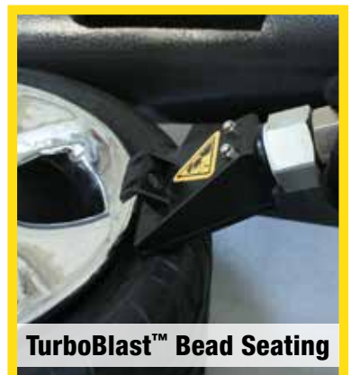
TurboBlast™ Bead Seating