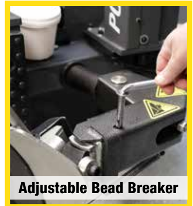
Adjustable Bead Breaker