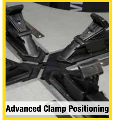
Advanced Clamp Positioning